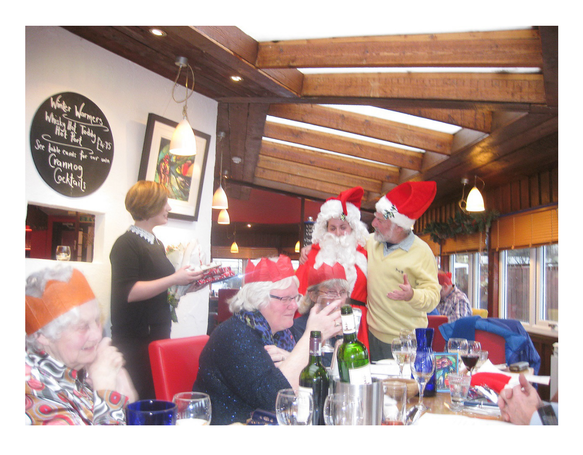
Santa and helper