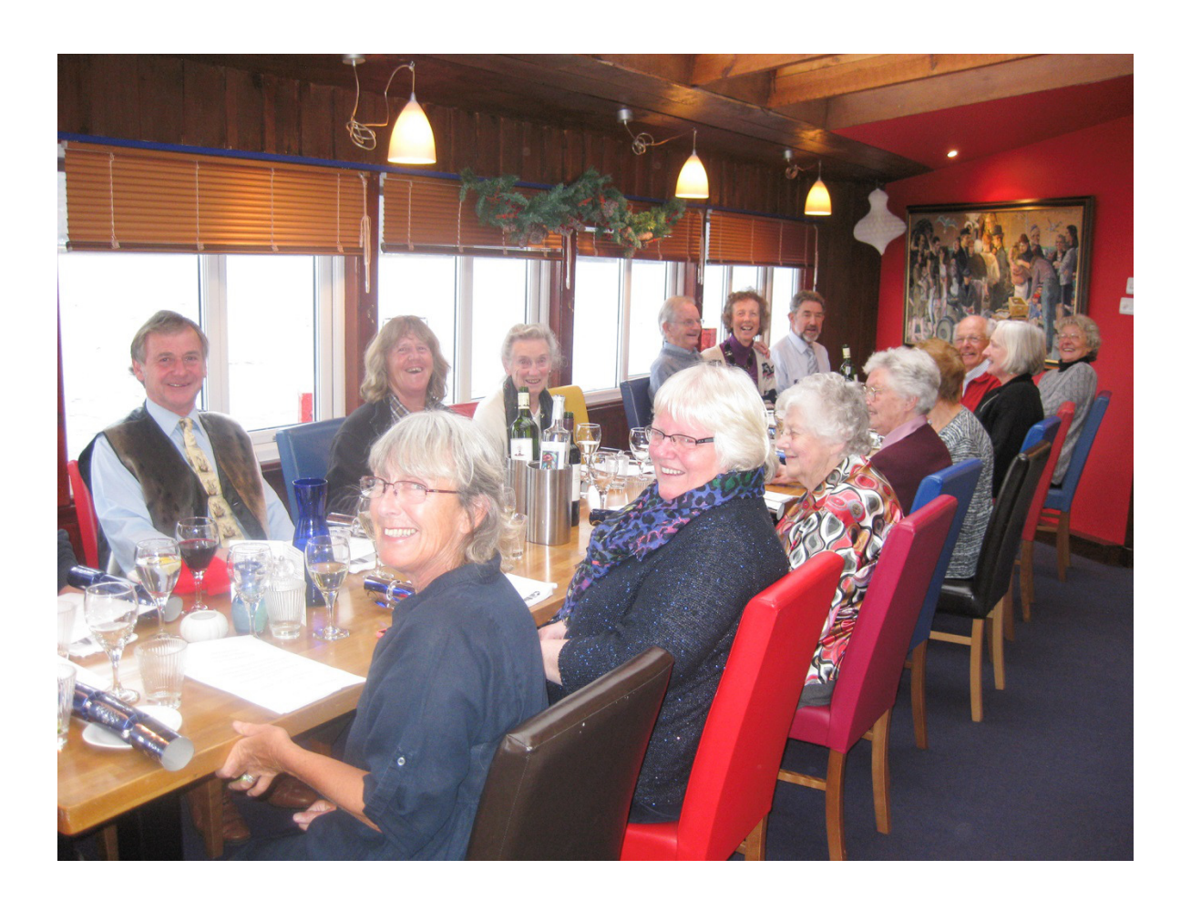
Christmas lunch at the Crannog restaurant.